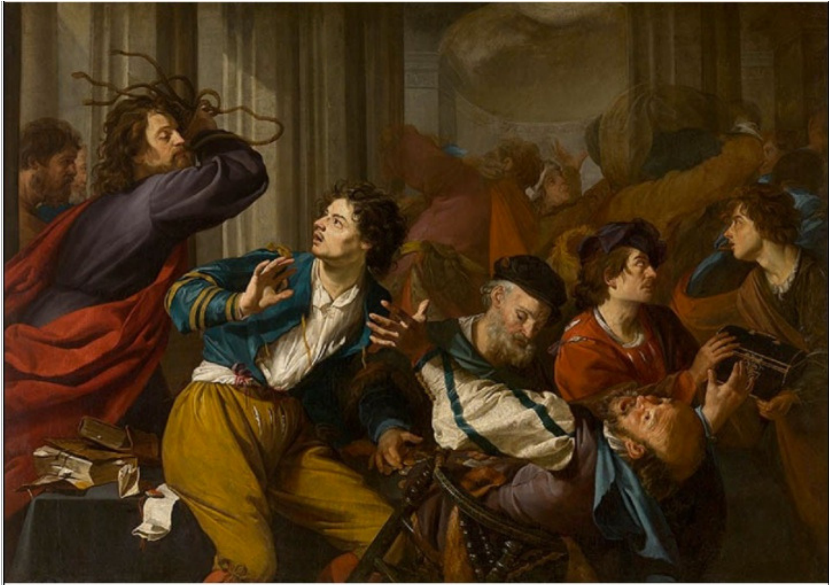
Monday of Holy Week: Clearing the Temple, The Cursing and Withering of the Fig Tree

Almighty God, whose most dear Son went not up to joy but first he suffered pain, and entered not into glory before he was crucified; Mercifully grant that we, walking in the way of the cross, may find it none other than the way of life and peace; through the same thy Son Jesus Christ our Lord. Amen.